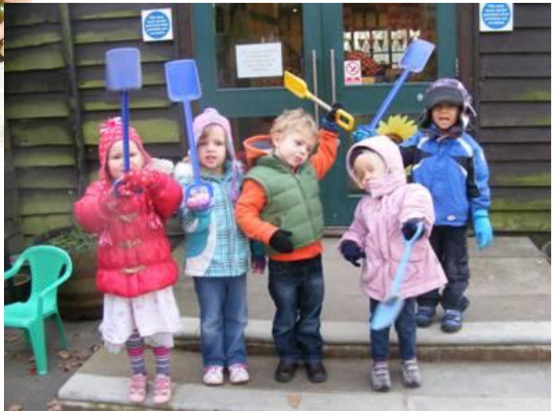
Figure 1 Off to hunt for dinosaur bones...

Please make sure that all Nursery children have a complete change of named clothes (including socks) in a bag on their peg. This is helpful for when we've been jumping in muddy puddles! Thank you.