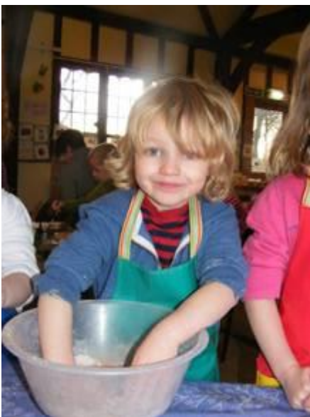
Figure 2 Baking dinosaur cookies