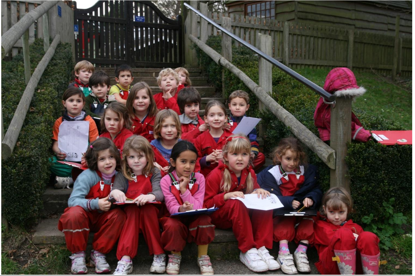
Figure 5 Year 2 have finished their orienteering lesson