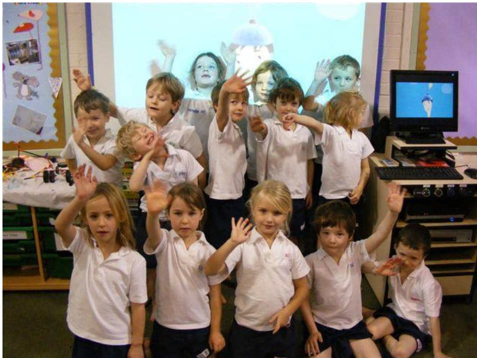
Figure 4 Happy New Year from Year 1.