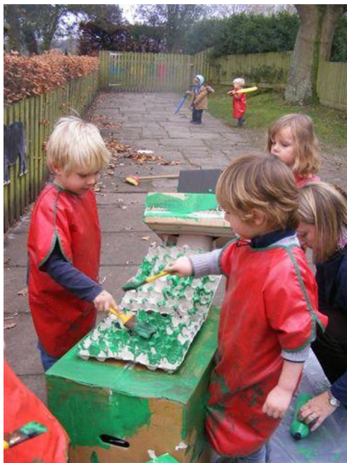
Figure 7 & 8 Dinosaurs have arrived in the Nursery!