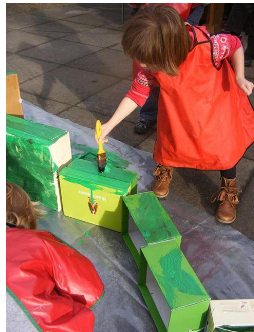
Figure 10 & 11 Watch out for our Dunannie Nursery art exhibition coming soon.