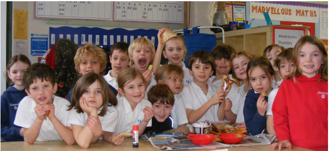
Figure 6 Photo of all year 3 in the snack cafe!