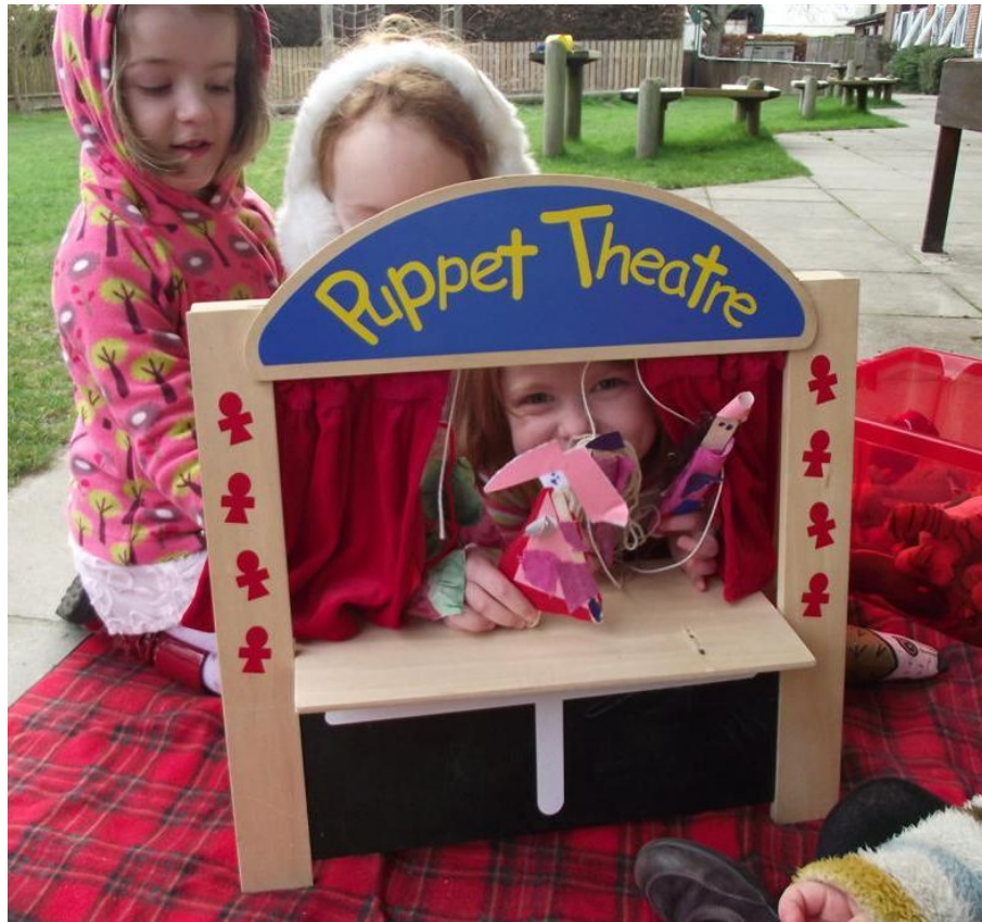
Figure 3. Using the puppet theatre with puppets that we have made!