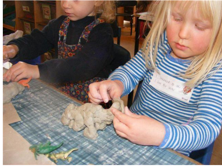
Figure 9 We are making a huge dinosaur model together as well as making clay models