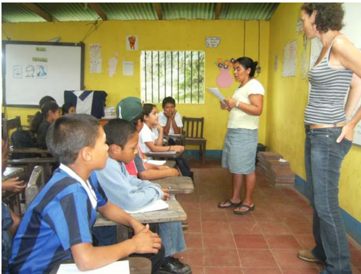
The Head of Escuela Vicente Talavera in Sontule reading out the letters written in Spanish from Dunhurst pupils.

At Dunhurst School the pupil led Fair Trade committee have raised funds by selling coffee at school functions and have established links with the children in Miraflores by writing letters to them in Spanish.