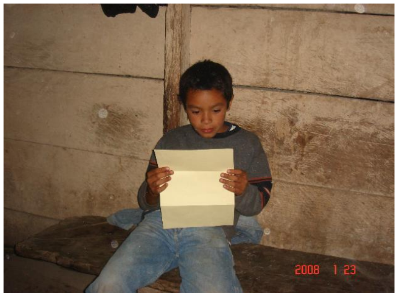
Reading a letter from a pupil at Dunhurst School.