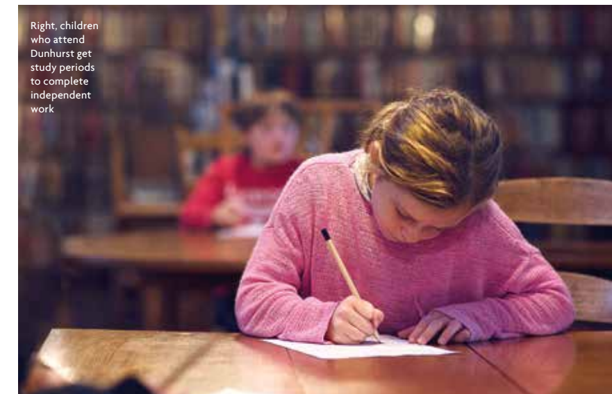
Right, children who attend Dunhurst get study periods to complete independent work