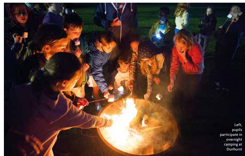
Left, pupils participate in overnight camping at Dunhurst

Our pupils are incredibly kind, thoughtful and accommodating. Nothing was too much trouble for them when it came to making sure I knew where I was going next