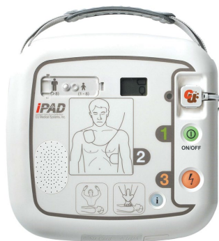
Ipad SPI Semi-automatic defibrillator

The AED is a sophisticated, reliable, safe, computerised device that delivers defibrillatory shocks to a person in cardiac arrest. It uses voice prompts to guide the user and is suitable for use by both lay rescuers and healthcare professionals. Bedales School has three Ipad SPI Semi-automatic defibrillators around the school and one Zoll AED Plus defibrillator in the Health Centre. These analyse the victim's cardiac rhythm, determine the need for a shock, and then deliver a shock where appropriate. The voice prompts will deliver a step-by-step guide on what action to take including when to perform manual cardiopulmonary resuscitation (CPR).