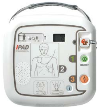
IPad SP1 Semi-automatic defibrillator